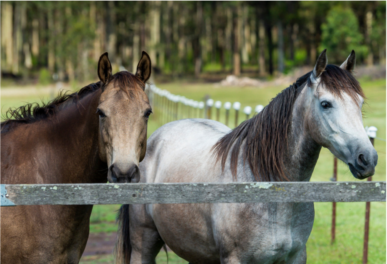
Nala and Denny aka the HEAL herd greeting our clients. That's Denny on the left and Nala on the right.

This is the HEAL herd's first adventure into creating a newsletter. HeartSounds newsletter will be occasional notes from our hearts to yours.